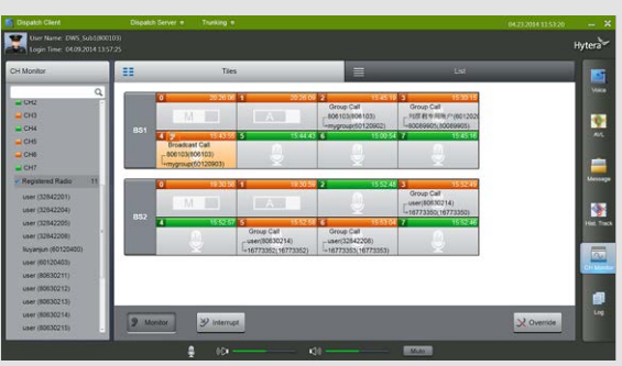
Channel monitoring in DWS (DMR)