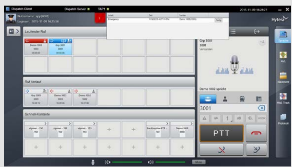
Call overview in DWS

Some functions may be DMR or TETRA-specific. A detailed overview of the functions can be provided on request.